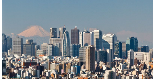
Tokyo's skyscrapers and Mount Fuji

The Sixteenth International Conference on Machine Vision Applications will be held in Tokyo, Japan from May 27 through 31, 2019. The conference is sponsored by the MVA Organization, co-organized by IEICE PRMU and IPSJ SIG-CVIM, and endorsed by IAPR. The aim of this conference is to bring together researchers and practitioners from both academia and industry, and to stimulate the exchange of knowledge through intensive discussions on cutting-edge research topics.