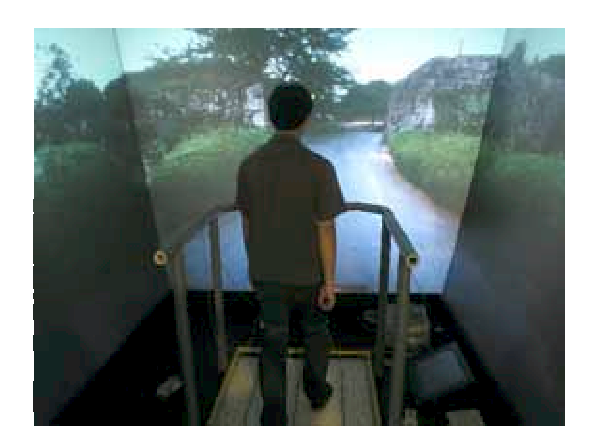
Figure 5. Appearance of the system.

was felt due to the limitation of user's view position in a virtualized environment : the user can not move in two dimensions in the presenta system. We also felt unnatural in the control of the treadmill when a user begins to walk, because the motion of upper part of the body is not considered in motion measurement; that is, the displayed image is not actually synchronized with head motion but with leg motion.