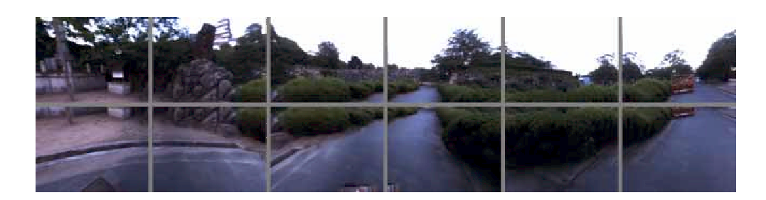
Figure 4. Sampled frame of generated video accumulated in twelve graphics PCs.

Figure 3. Sampled frame of captured videos acquired by six camera units of Ladybug.