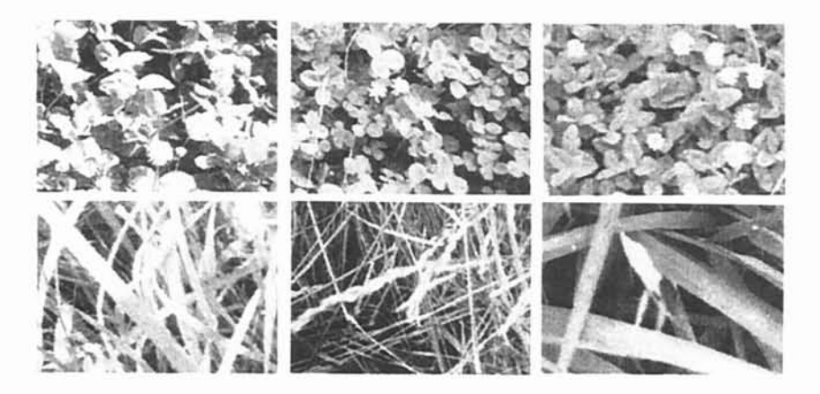
Figure 2: Training pictures (upper: clover, lower: weed)