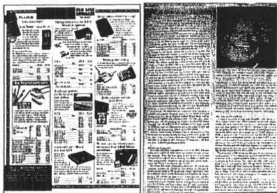
Figure 2: Difficult cases in page segmentation. (a) Complex document layout. (b) Degraded document.

and Japanese documents, such as books, facsimile transmissions, journals, magazines and newspapers. The experiments showed promising results in segmenting complex documents.