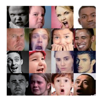
Figure 1. Candid face samples of various poses. Table 3. Performance of the baseline approaches on our CIFE dataset vs on CK+