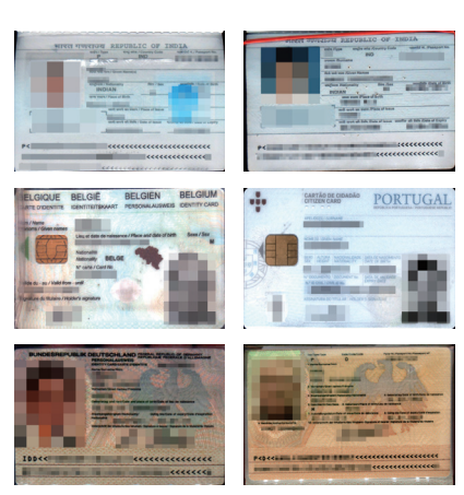
Figure 1. Anonymized examples of documents that are distinguished by our system. Each image represents a different class with a unique text layout in the dataset. From top to bottom: Indian passport version 5 and 6, Belgian and Portuguese ID card, German ID card version 4 and German passport version 10. Notice how the pictures and texts vary greatly within the same class while the discriminative parts are subtle. Best viewed in color.

However, due to the text being different on every document and the visual similarity of some documents,