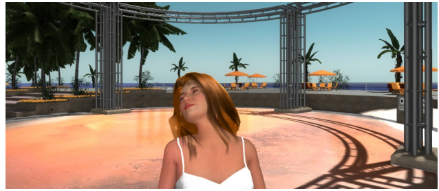
Figure 2. Welcome Area in Blue Mars 3D world (1.51 M triangles @ 30 FPS). The avatar head is tilted back and sideways, copying user head pose. Tracking has no impact on FPS in this scene.

To investigate further, we measured the system performance in scenes with separate types of content: static meshes that use little of CPU time and dynamic objects that require processing on CPU. For that purpose, we used the standard avatar model from Blue Mars SDK, with cloth and hair simulated by mass-spring models. In static tests scenes, simulation was turned off and avatars were rendered as static meshes. In dynamic tests, the avatars were running the “standing-idle” animation, with cloth and hair deformed on CPU at every frame, illustrated in Figure 3.