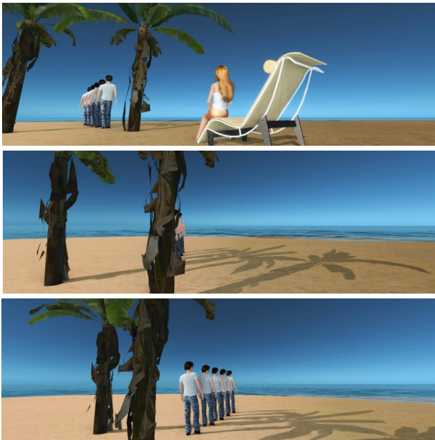
Figure 8. Camera sliding for a simple counting task. Top: external view. Center: female player's view, with all objects of interest occluded by a tree. Below: prompted by used head rotation, camera slides to the right, removing occlusion.

On the contrary, non-immersive games are more flexible about camera controls, providing a variety of viewing options, such as free-camera mode, third-person or aerial view. Thus, user head motion can be treated as loosely coupled with various viewing tasks. As an example, we implemented camera-sliding technique, which moves the virtual camera sideways, when the user rotate their head left or right, for more than 30 degrees. This technique appears useful in scenes where occluding objects are present, at close range. The test scene is shown in Figure 8.