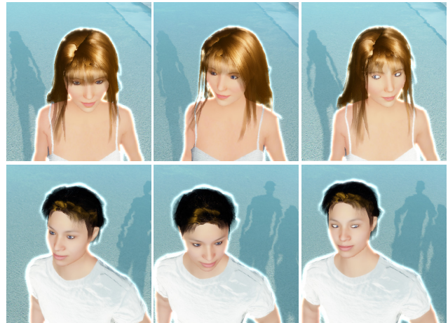
Figure 6. Two avatars are facing each other. Left pair: normal idle pose when neither avatar shows signs of noticing its neighbor. Middle pair: “look-around” feature is in effect, making the avatars look at each other. Right pair: user head rotation is added, changing the avatar’s facial expressions.

We improved this automatic behavior using head rotation. While the avatar’s eyes remain locked on the object of interest (i.e., the other avatar’s face), additional head rotations produce new facial expressions, such as teasing, disbelief, or turning someones nose up, as illustrated in Figure 6.