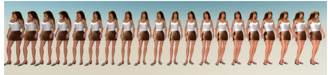
Figure 3. Test scene with 20 clothed hair-styled animated avatars, processed on CPU.