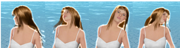
Figure 5. Direct transfer of player’s head rotation to avatar’s neck joint. The rotation is added to the currently active animation (e.g., idle motion), blending the two motions smoothly and yielding a variety of natural looking movements.

This is the most straightforward example of motion data transfer. The user head rotation is applied to the avatar neck joint, making the avatar reproduce user head movements. Head rotation is added in a layered fashion, blending user motion with the current avatar pose. Although the technique is simple, it allows to create expressive poses, demonstrated in Figure 5.