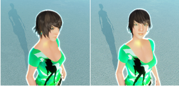
Figure 7. Avatar awareness of player presence. Left: idle behavior. Right: attention on player. Tracking will make the avatar continuously maintain eye contact with the player.