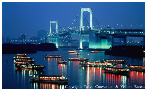
Night view of ODAIBA, near the conference site

The Fourteenth IAPR International Conference on Machine Vision Applications will be held at the MIRAikan: National Museum of Emerging Science and Innovation in Tokyo, Japan from May 18 through 22, 2015. The conference is co-sponsored by the MVA Organization, IAPR TC-8 and AIST JAPAN. The aim of this conference is to bring together researchers and practitioners from both academia and industry, and to stimulate the exchange of knowledge through intensive discussions on the cutting-edge research topics listed below.