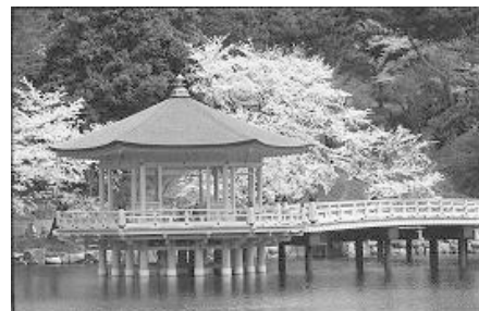
Figure 1. Figure caption.

Figures and Tables: Figures and tables should be centered. Figure caption should be centered, 10-point Times, and placed below the figure. Table caption should be typed as those for figures, except it should be placed just above the table.