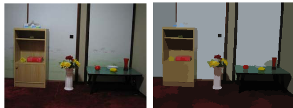
(a) Original image. (b) Segmented image.

We performed experiments in various cases to confirm the usefulness of our method. We show two examples here. The experimental images are shown in Figure 1.