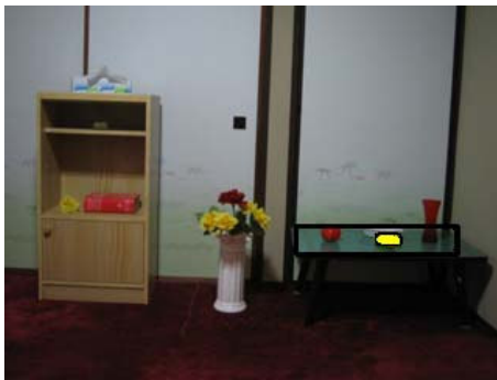
Figure 3. Mango on the Table.

In this example, the robot has no knowledge of the attached object for the detached object Mango. If the robot tries to find out the Mango just as a yellow object without environmental knowledge, it may find too many candidate objects. Thus, the robot first asks the user about the associated attached object. Then, from the knowledge of the attached object Table, the robot moves to the table and recognizes it using its attributes. After that, the robot finds out the Mango on the Table based on the attribute of Mango (Figure 3).