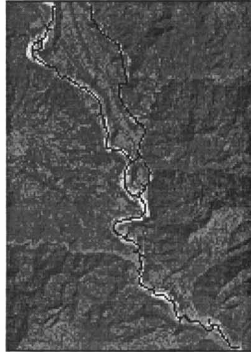
Figure 3: Extracted River Network