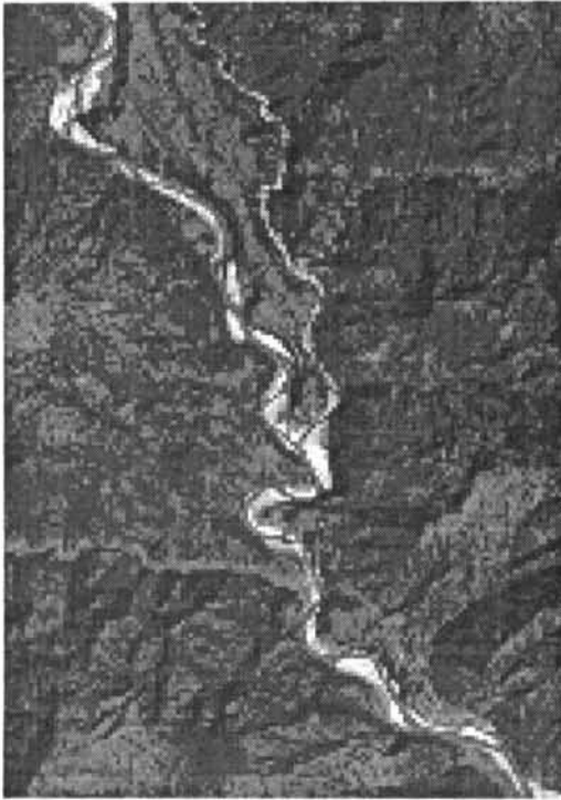
Figure 2: Raw Satellite Image