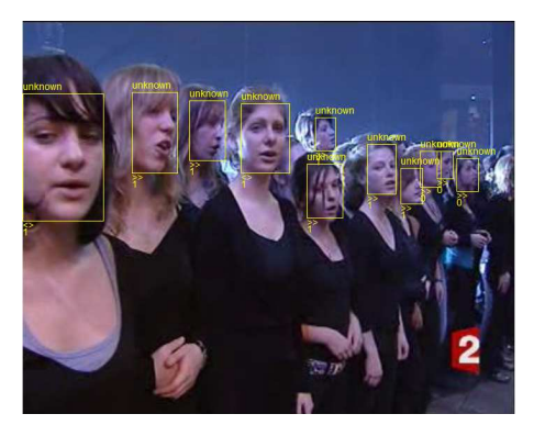
Figure 2. Sample frame in the broadcast news video annotated with face bounding boxes and identities.

There are usually several faces appear in one frame in news videos. To be able to evaluate both face tracking and person identification, face bounding boxes and identities are annotated. Since it is a large scale database, annotating every frame is not possible. For the moment only one frame per second is annotated. Furthermore, as we are only interested in faces up to a certain scale, faces which are larger than 20 \times 20 pixels size are labeled. We also ignore the faces with severe occlusion since they are usually hard to detect and also cause problem for recognition. An example of one annotated frame is shown in Fig. 2.